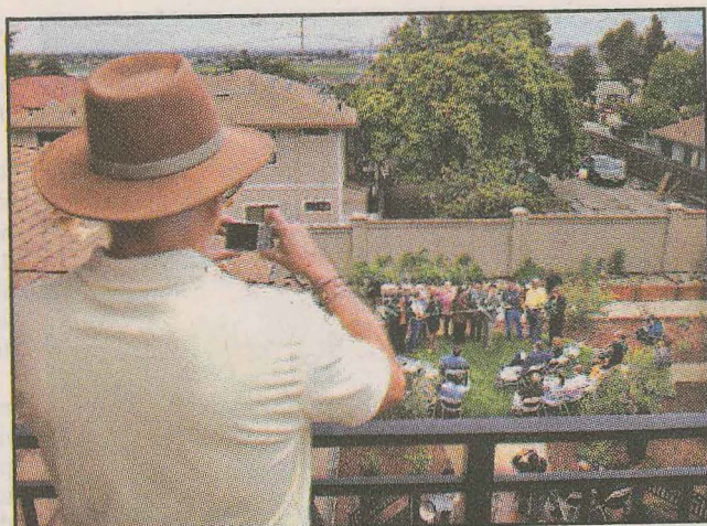
Raymond Moreno photographs CHISPA staff, supporters and honorees as they cut the ribbon for the complex.